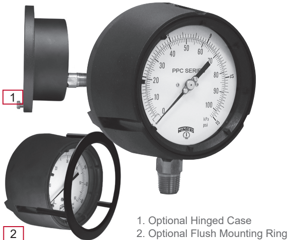
1. Optional Hinged Case 2. Optional Flush Mounting Ring