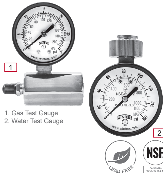
1. Gas Test Gauge 2. Water Test Gauge