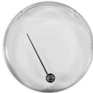
RSP - Setpoint indicator